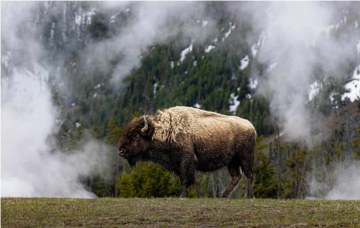
“Buffalo in Yellowstone”

The Picture was taken in early May of this on a trip home from Seattle. We did see a lot of buffalo as we drove around the park that day. We stopped to walk around some geysers and hot pools.